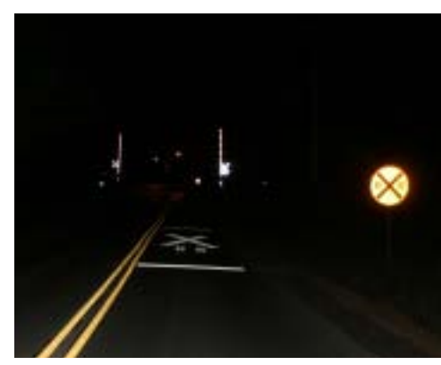
Improved safety with 3M 380 IES pavement marking tape and 3M DG3 - Diamond Grade sheeting sign upgrade